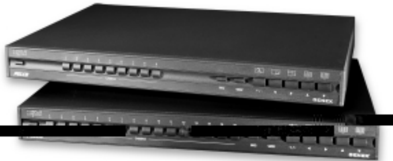
MX4009MS (TOP) MX4016MS (BOTTOM)

Genex is easy to use, offers intuitive push-button controls for operation and password-protected, on-screen menus for easy system setup.