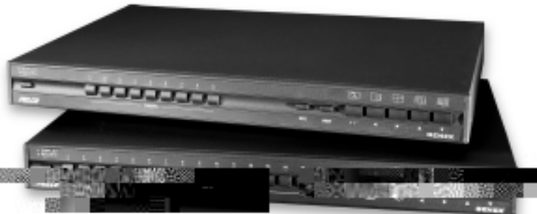
MX4009CS (TOP) MX4016CS (BOTTOM)

Genex is easy to use, offers intuitive push-button controls for operation and password-protected, on-screen menus for easy system setup.