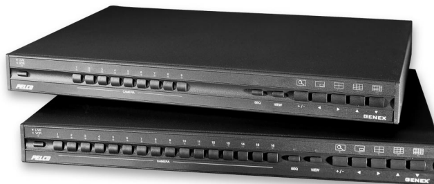
MX4009CD (TOP) MX4016CD (BOTTOM)

International Standards Organization Registered Firm ISO 9001 Quality System