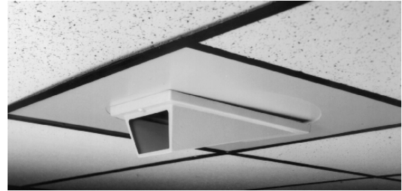
EH2100 MOUNTED IN DROPPED CEILING USING E2100 MOUNTING PLATE

The EH2100 and EH2100P are low profile ceiling enclosures designed for use with medium-to-large format cameras. The unobtrusive, compact design complements any business or office decor.