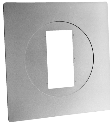
E2100 ROTATING MOUNTING PLATE

NOTE: VALUES IN PARENTHESES ARE CENTIMETERS; ALL OTHERS ARE INCHES.