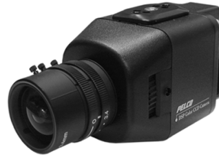
(REAR COVER REMOVED)