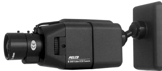
CAMERA MOUNTED ON PCM100 CAMERA MOUNT