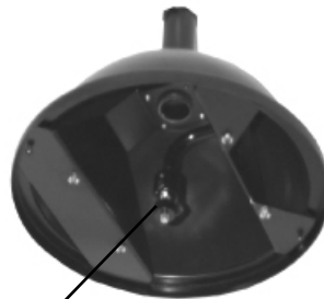
Bracket for regular camera