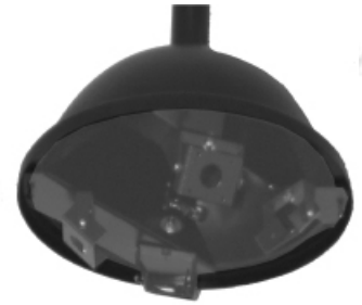
Shown with optional FS-0032 for camera board